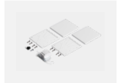
00-20103, W 2xend cap - plastic, 5- conductor terminal box, grommet; Lipo80/Lina80