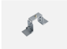
00-20900, F bracket for installation of suspended type of profile as recessed trimless