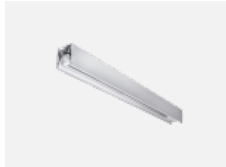
00-21300, W Lipo80-S, Lina80-S - pendant profile for track luminaires; l = 1122mm