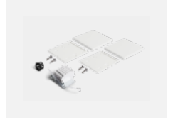
00-20101, W 2xend cap - metal, 5- conductor terminal box, grommet; Lipo80/Lina80