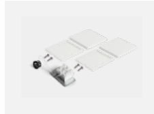
00-20100, W 2xend cap - metal, 3- conductor terminal box, grommet; Lipo80/Lina80