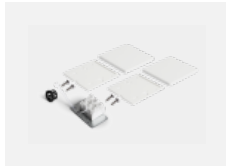
00-20100, W 2xend cap - metal, 3- conductor terminal box, grommet; Lipo80/Lina80