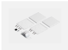
00-20103, W 2xend cap - plastic, 5- conductor terminal box, grommet; Lipo80/Lina80