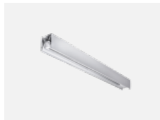
00-21300, W Lipo80-S, Lina80-S - pendant profile for track luminaires; l = 1122mm