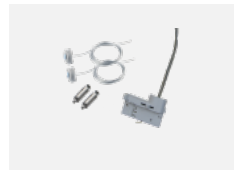
00-51300, W set for suspension into 3-phase track, non- dimmable luminaires