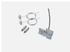
00-51301, W set for suspension into 3-phase track, dimmable luminaires