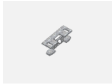
00-00600, F ceiling fastening for luminaires 132-5xxK, 04-2000x, 05-2000x, 09-200x - 1 piece