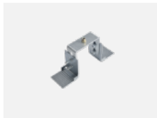
00-20900, F bracket for installation of suspended type of profile as recessed trimless