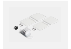
00-20101, W 2xend cap - metal, 5- conductor terminal box, grommet; Lipo80/Lina80