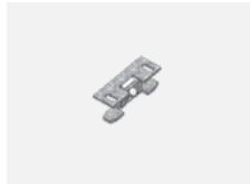
00-00600, F ceiling fastening for luminaires 132-5xxK, 04-2000x, 05-2000x, 09-200x - 1 piece