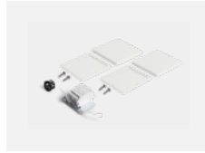
00-20101, S 2xend cap - metal, 5- conductor terminal box, grommet; Lipo80/Lina80