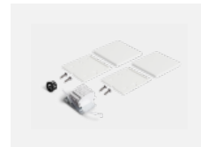
00-20101, W 2xend cap - metal, 5- conductor terminal box, grommet; Lipo80/Lina80