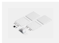
00-20103, W 2xend cap - plastic, 5- conductor terminal box, grommet; Lipo80/Lina80