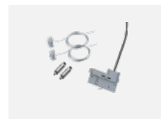
00-51300, W set for suspension into 3-phase track, non- dimmable luminaires