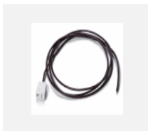
00-00500 wire for emergency lighting XX-XXXX-20