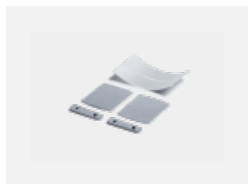
00-00200, N straight connector