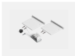
00-00100, W 2xend cap - metal, 3- conductor terminal box, grommet; Lipo80