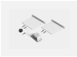
00-00100, W 2x end cap - metal, 3- conductor terminal box, grommet; Lipo80