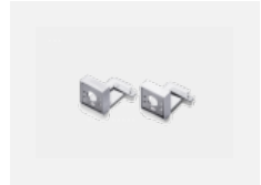
00-20700, W 2 pcs of wall fastening Lipo/Lina