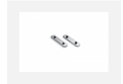
04-00200, N straight connector