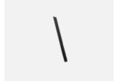
00-00358, B cable 3x0,75 4000mm, black