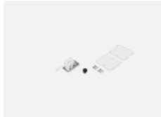
04-20100, B 2xend cap - metal, 3- conductor terminal box, grommet