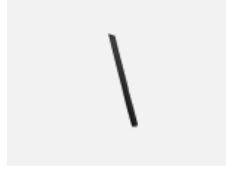
00-00352, B cable 3x0,75 2000mm, black