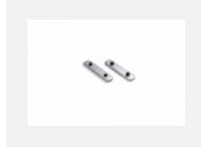
04-00200, N straight connector