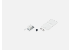
04-20100, W 2xend cap - metal, 3- conductor terminal box, grommet