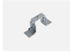
04-20900, F bracket for installation of suspended type of profile as recessed trimless