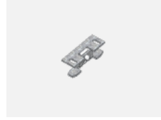
00-00600, F ceiling fastening for luminaires 132-5xxK, 04-2000x, 05-2000x, 09-200x – 1 piece