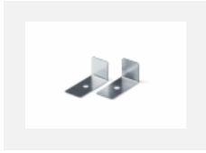
04-01200, F Accessory for gear-tray release