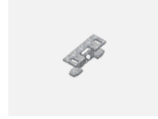
00-00600, F ceiling fastening for luminaires 132-5xxK, 04-2000x, 05-2000x, 09-200x – 1 piece