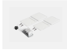
04-20102, W 2xend cap - plastic, 3- conductor terminal box, grommet