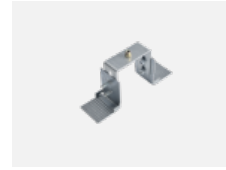
04-20900, F bracket for installation of suspended type of profile as recessed trimless