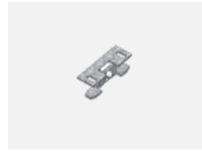
00-00600, F ceiling fastening for luminaires 132-5xxK, 04-2000x, 05-2000x, 09-200x – 1 piece