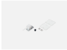
04-20101, W 2xend cap - metal, 5- conductor terminal box, grommet