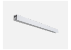
04-21303, W pendant profile for track luminaires; l = 1122mm