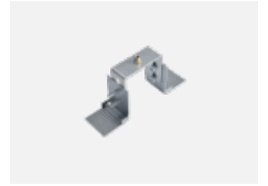
04-20900, F bracket for installation of suspended type of profile as recessed trimless