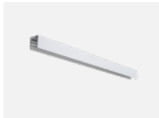
04-21307, W pendant profile for track luminaires; l = 2242mm