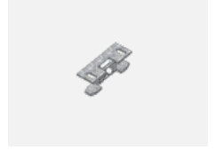
00-00600, F ceiling fastening for luminaires 132-5xxK, 04-2000x, 05-2000x, 09-200x - 1 piece