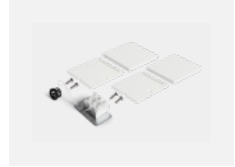
04-20102, B 2xend cap - plastic, 3- conductor terminal box, grommet