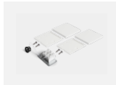
04-20102, W 2xend cap - plastic, 3- conductor terminal box, grommet