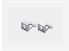
00-20700, W 2 pcs of wall fastening Lipo/Lina