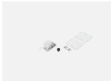
04-20101, W 2xend cap - metal, 5- conductor terminal box, grommet