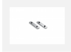
04-00200, N straight connector