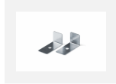
04-01200, F Accessory for gear-tray release