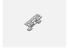
00-00600, F ceiling fastening for luminaires 132-5xxK, 04-2000x, 05-2000x, 09-200x - 1 piece