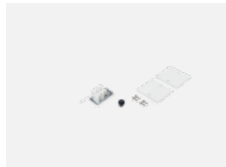
04-20100, W 2xend cap - metal, 3- conductor terminal box, grommet