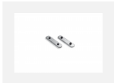
04-00200, N straight connector