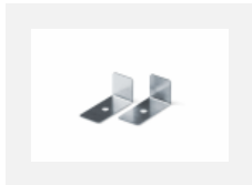
04-01200, F Accessory for gear-tray release