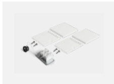
04-20102, W 2xend cap - plastic, 3- conductor terminal box, grommet