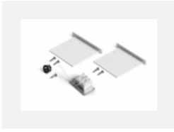
04-00100, W 2x end cap - metal, 3- conductor terminal box, grommet