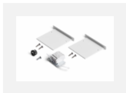
04-00101, S 2x end cap - metal, 5- conductor terminal box, grommet