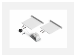
04-00100, B 2x end cap - metal, 3- conductor terminal box, grommet