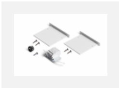
04-00101, B 2x end cap - metal, 5- conductor terminal box, grommet