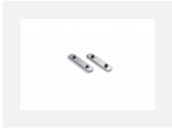
04-00200, N straight connector