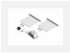
04-00100, B 2x end cap - metal, 3- conductor terminal box, grommet