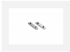
04-00200, N straight connector