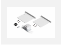
04-00101, B 2xend cap - metal, 5- conductor terminal box, grommet