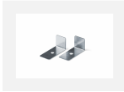
04-01200, F Accessory for gear-tray release