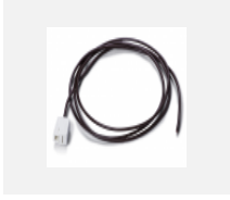
00-00500 wire for emergency lighting XX-XXXX-20