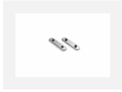
04-00200, N straight connector