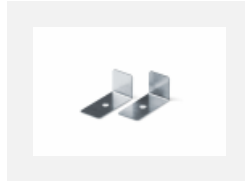
04-01200, F Accessory for gear-tray release