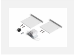
04-00101, S 2x end cap - metal, 5- conductor terminal box, grommet