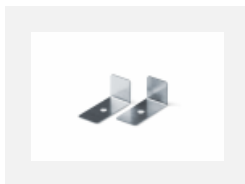
04-01200, F Accessory for gear-tray release